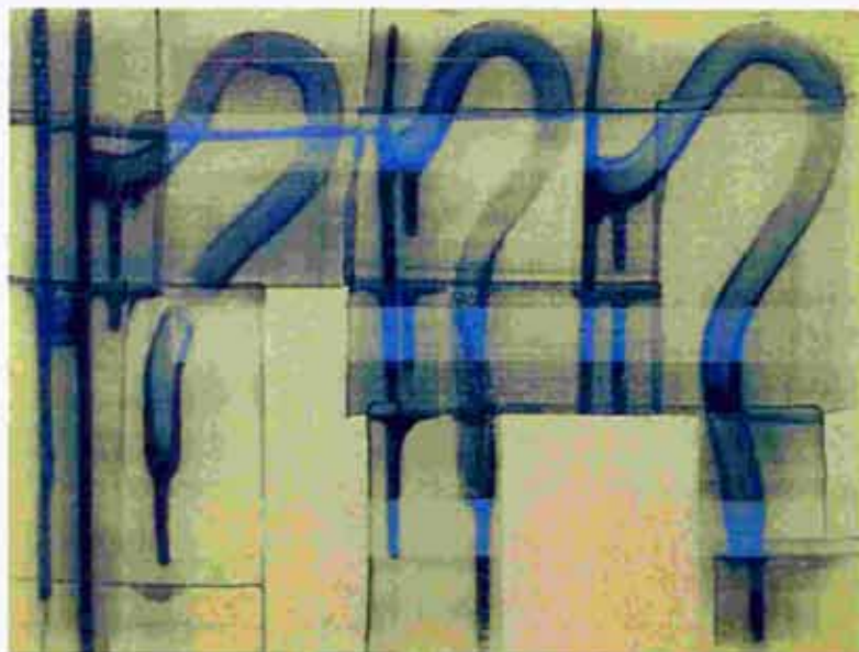
LEFT: David Blatherwick One Second 1998 Oil on canvas 1.4 x 1.4 m