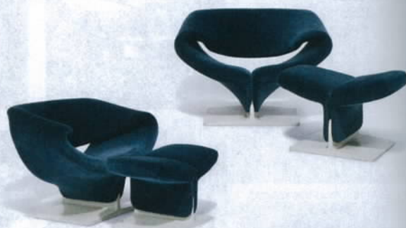
"Pair of lounge chairs, modern", estimate: £4,000 to £6,000 (€5,100 to €7,700)

"Gentleman's compact wardrobe, modern", estimate: £3,000 to £5,000 (€3,850 to €6,400)