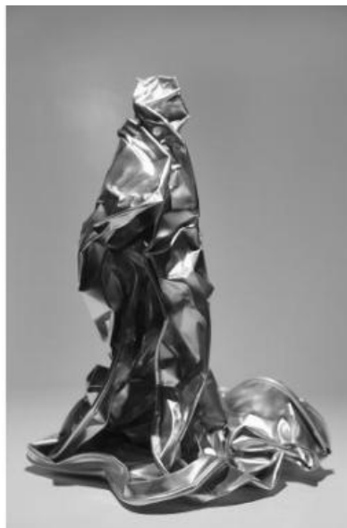
Gubash: "Proposal for a Monument 6," 2016. Inkjet printing on Ilford archival ultra glossy, 35.5 cm x 24 cm

Galerie Trois Points, Montreal, presents "Long Way Gone," an exhibition by artist Milutin Gubash. The exhibition is currently on view and will run through December 17, 2016.